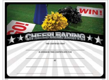
No. ATH13 Cheerleading