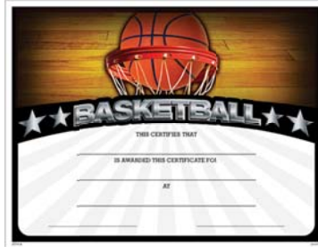
No. ATH14 Basketball