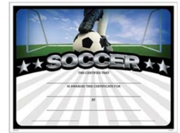
No. ATH18 Soccer