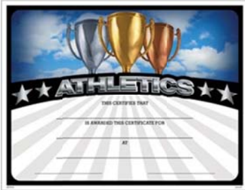
No. ATH11 Athletics