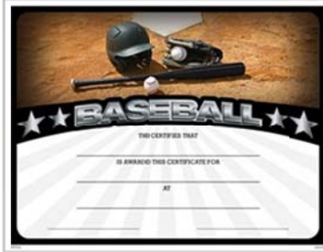
No. ATH12 Baseball