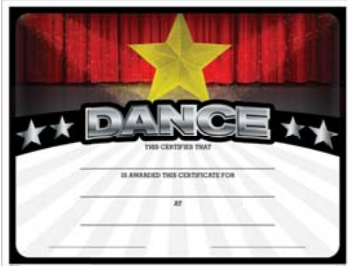
No. ATH15 Dance