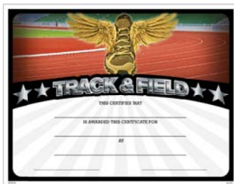
No. ATH19 Track & Field