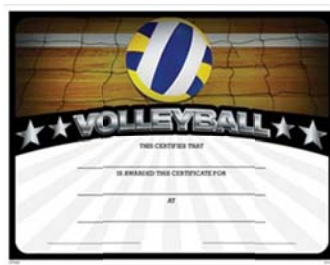
No. ATH20 Volleyball