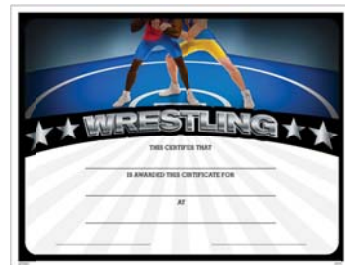
No. ATH21 Wrestling