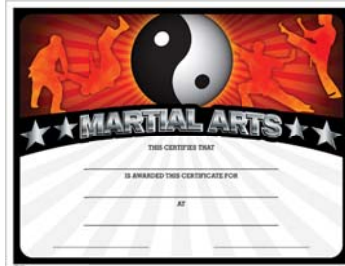
No. ATH17 Martial Arts